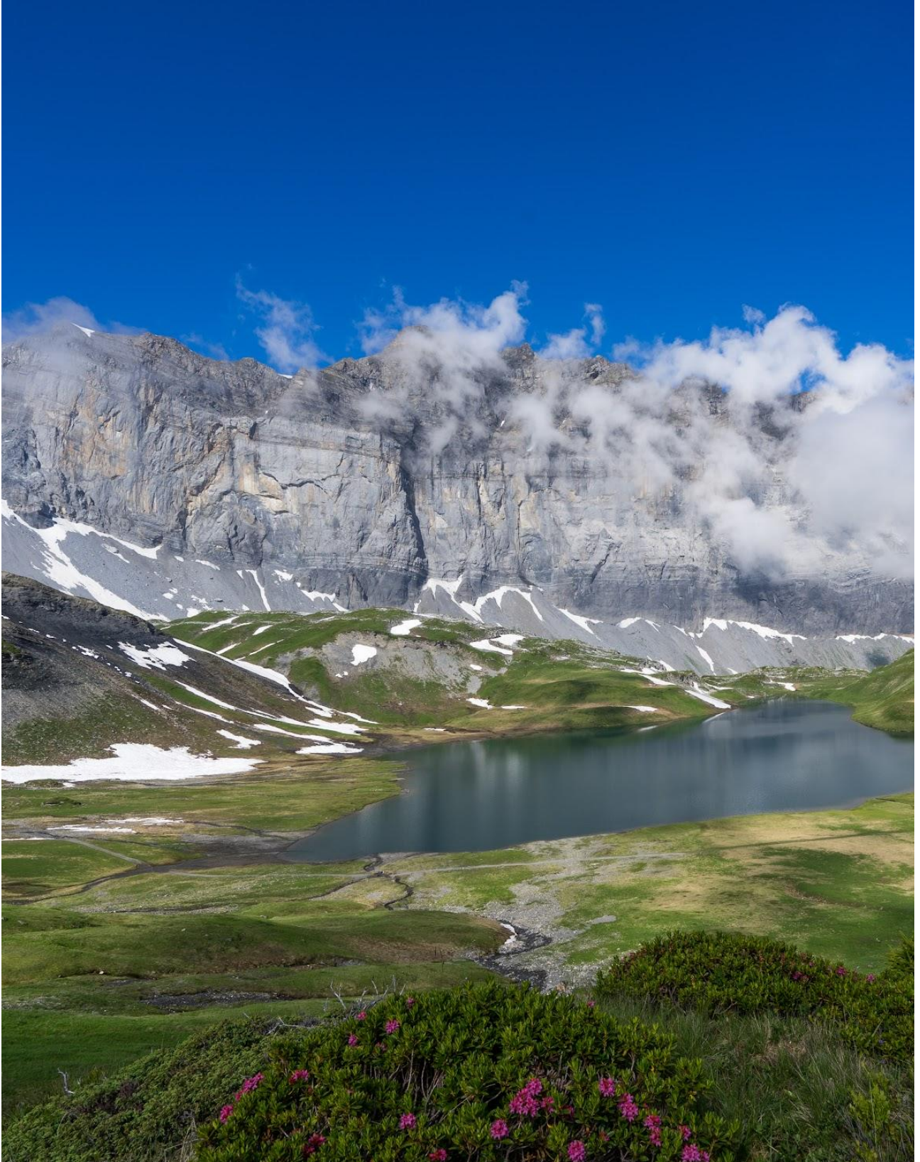
Massif des Fiz and Lake Anterne